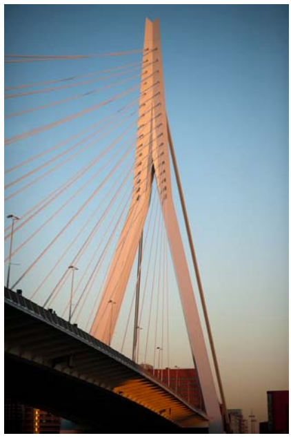
The Erasmus Bridge, Rotterdam

We are living through uncertain times, and the most dramatic surge in urban growth in human history. Countries across the globe are seeking ways to profit from the benefits and protect themselves from the risks of globalisation, such as competition from emerging new economies, porous borders and increasingly mobile populations, rapid urban growth and its devastating effects on the environment. The power of cities to act as influential hubs with their own political direction and economic, social and cultural strategies could not be clearer.