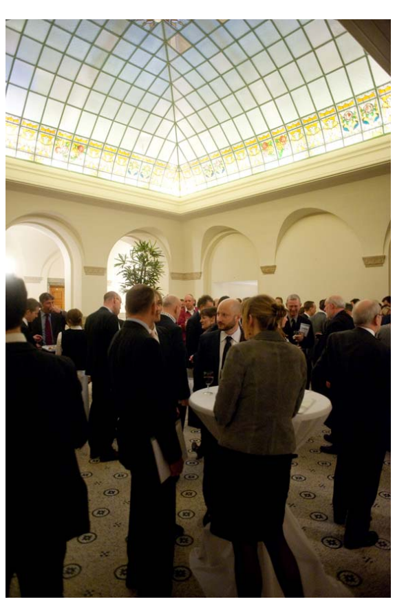
Opening Reception, Rotterdam City Hall

More than half of the human race now lives in cities. By 2050, the planet will be even more densely urbanized, with many predicting that more than 70% of the population of China and more than half of all those living on the African continent will be based in urban centres. It is vital that