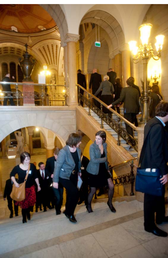
Dinner and networking in the Burgerzaal, Rotterdam City Hall