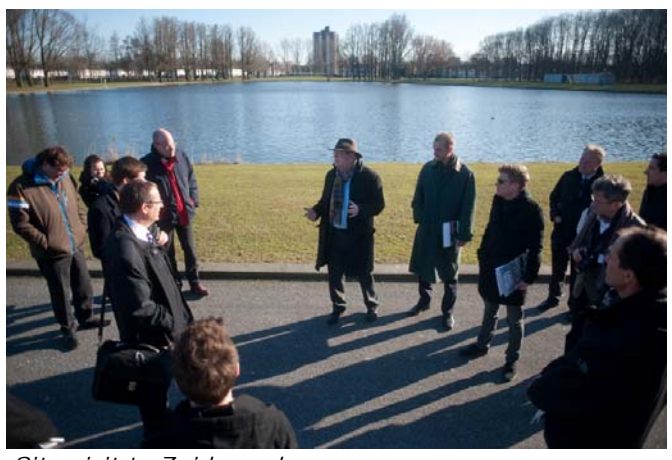
Site visit to Zuiderpark

In Rotterdam, water management is extremely important. The city lies approximately 15 feet below sea level and is one of the major river deltas of Western Europe. Rotterdam operates a Climate Proof Programme aimed at making the city fully climate-resilient by 2025. The programme has five themes; flood management, accessibility, adaptive building, urban water systems and city climate.